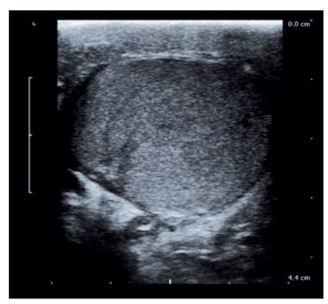
No conflict of interest declared.

Ultrasound control after three weeks from testicular sparing surgery.